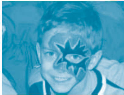
Face painting by About Faces