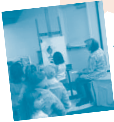
Community Art Project