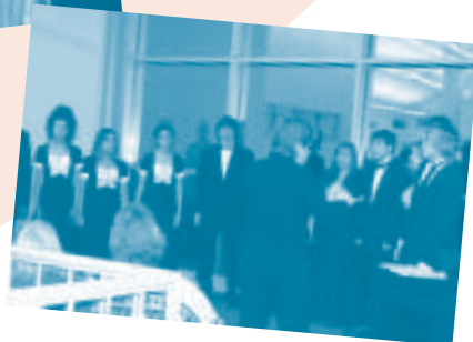
Riverside Brookfield High School Madrigals

Thank you to all those who made this event a success: