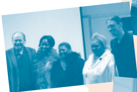
The Blues Seance Director and Cast