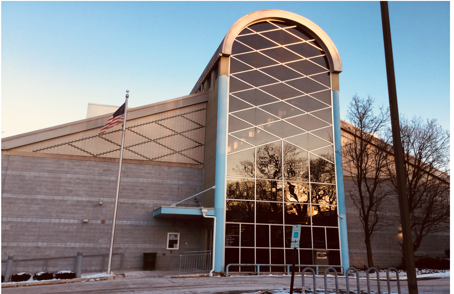
This is my library: The La Grange Park Public Library.